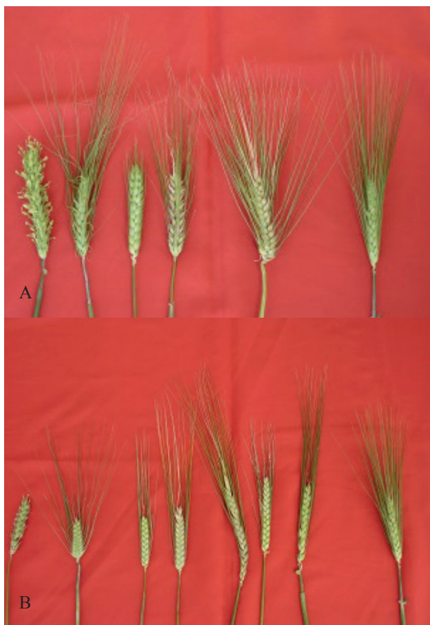
Figure 2. Spike morphology mutation types in barley cv UNALM 96 irradiated with 200 Gy of gamma ray at M_2 generation (A:6 row with different types of awn, B:two row with different types of awn. La Molina- Peru

Morphological characteristics mutations —In the M_2 and following generations, a wide mutation spectrum was identified. The population that developed with the dose of 200 Gray was studied and the following modifications were found: stem color (1.68%), auricle leaf color (3.3%), spike morphology (4.78%), awn color (2%), awn –light curly (0.43%), awnleted (5%), elevated hood (0.18%), sessile hood (0.19%) and naked grain (0.70%). Some of these spike morphology mutations are presented in Figure 2.