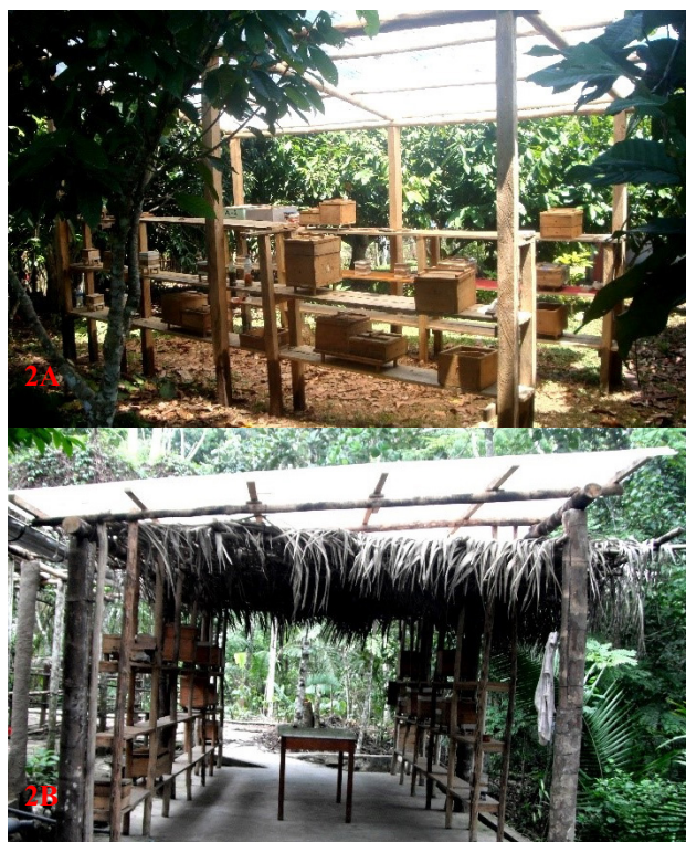
Figure 2. 2.A Meliponario Chasuta. 2.B Meliponario Tarapoto.

( n_1 = 15 ), M. illota ( n_2 = 4 ) and T. angustula ( n_3 = 11 ) were collected from 24 colonies (Table 1) reared in modern hives. Sterile syringes and a basic glove, lab coat and mask were used to extract the honey. Each sample consisted of the total amount of honey extracted from ten ripe pots randomly chosen within the colonies. The samples were